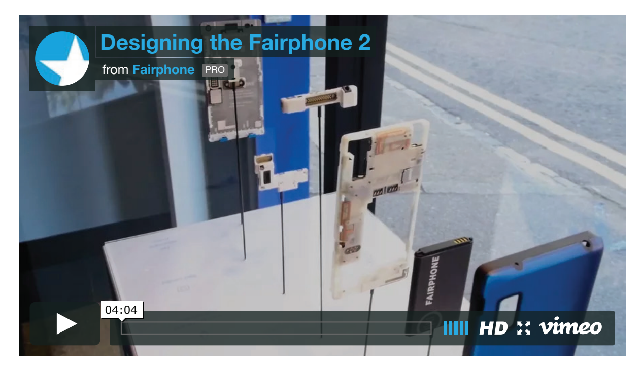
Designing the Fairphone 2

fairness, certain parameters of the program limited the company's visibility and control within the supply chain. "Fairphone 1 was a licensed design. We did not have the ownership over the materials and composition of the supply chain as much as we wanted."